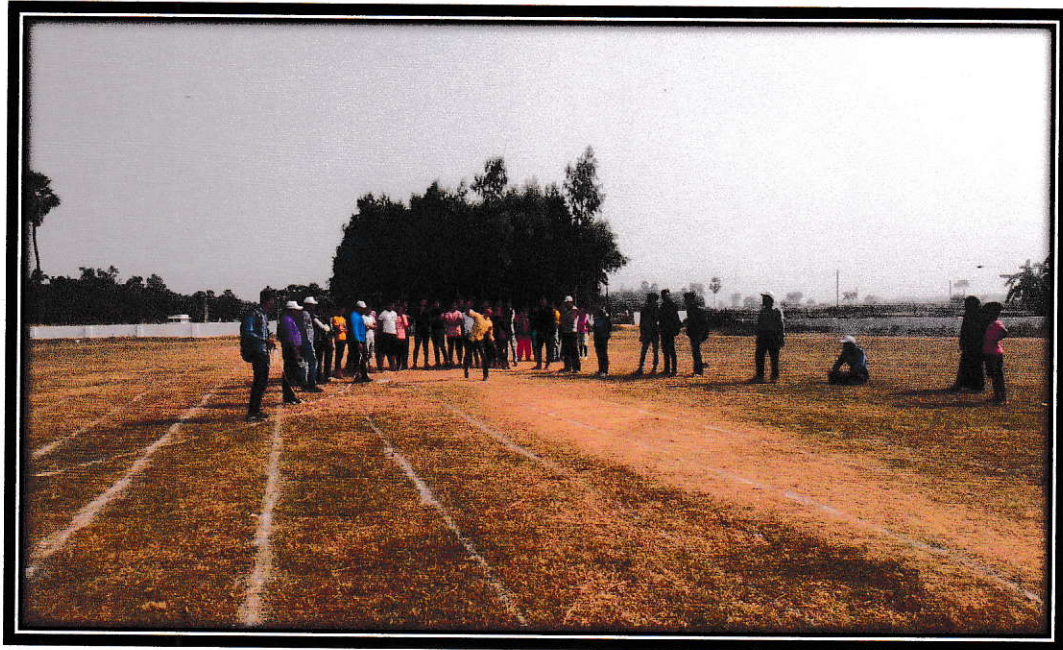
Inter college State Games and Sports Championship 2017-18(Athletics)