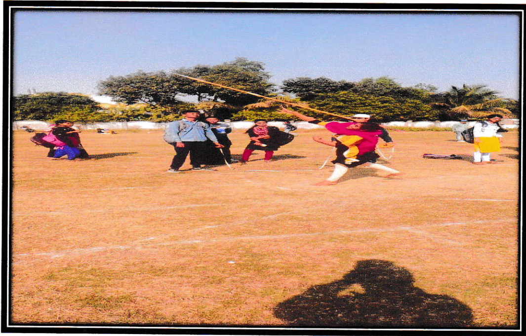
Inter college State Games and Sports Championship 2017-18(Athletics)